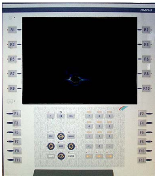
MAGELIS MAN-MACHINE INTERFACE